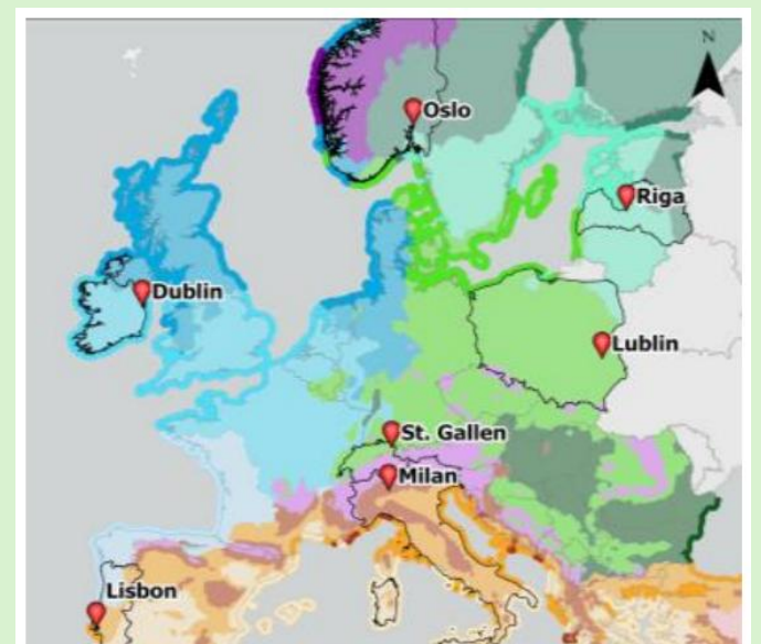
Fig. 2. NatureScape NBS T-Labs

https://www.linkedin.com/company/naturescape-project